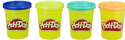
Play-Doh 4 Pack (any color)