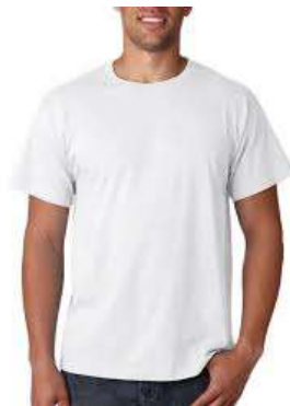
Plain white oversized T-shirt for STEAM project