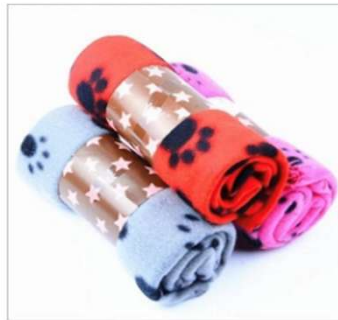
Small Blanket and Crib Sheet (to cover rest mat)