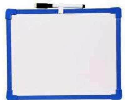
9in x 12in whiteboard with expo dry erase marker and eraser for student use