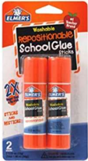
2 Fat Glue Sticks