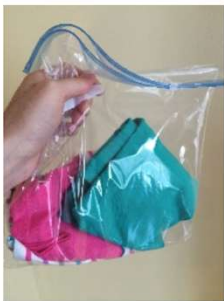
Extra Full Set of Clothes in a Ziplock Bag (labeled with student name, please include underwear and socks)