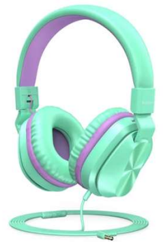
Kid Headphones (with a cable to connect into a computer)