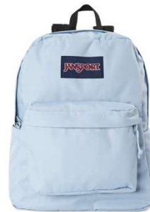
Bookbag (big enough to fit home learning folder; no wheels)