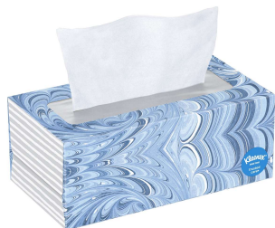
3 Boxes of Tissues