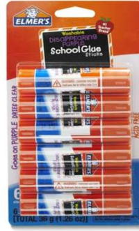
2 Pack of 6 Elmer's Disappearing Purple Washable School Glue Sticks