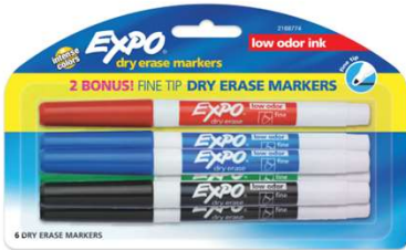
12 EXPO Dry Erase Markers (Fine Tip)