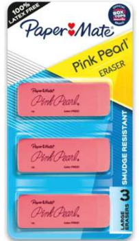
6 Pink Erasers