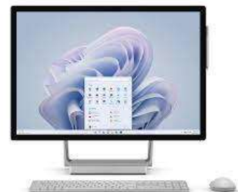
Computers will be used all year for classwork and homework. Please ensure you have access to a computer to complete homework assignments.