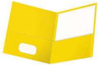
3-pronged folder 1 green 1 yellow 1 red