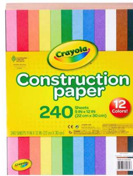
1 Pack of Crayola Construction Paper