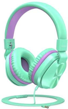
Kid Headphones (with a cable to connect into a computer)