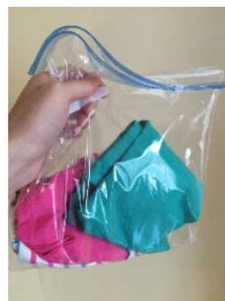
Extra Full Set of Clothes in a Ziplock Bag (labeled with student name, please include underwear and socks)