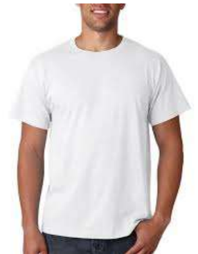
Plain white oversized T-shirt for STEAM project