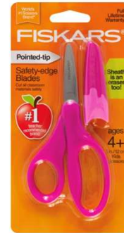
2 Kid Safe Scissors