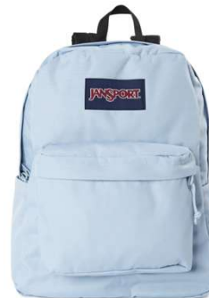
Bookbag (no wheels)