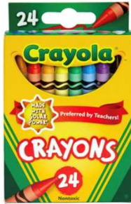
4 Packs of Crayola Crayons (24 color pack)