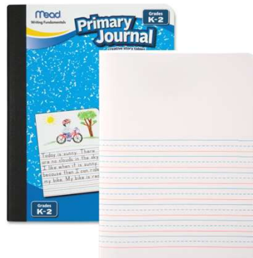
2 Primary Composition Books (half page/ refer to image, no college ruled notebooks)