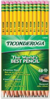
64 TICONDEROGA Yellow #2 Pencils (PRE-SHARPENED)