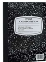
6 Composition Notebooks (Math, Science, Reading, Language Arts, Social Studies, & Intervention)