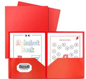
6 Plastic/Poly Duotang Folders with Fasteners and Pockets (Red, Blue, Yellow, Green, Orange, & Purple)