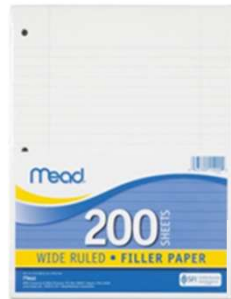
2 Packs of Wide Ruled Notebook Paper