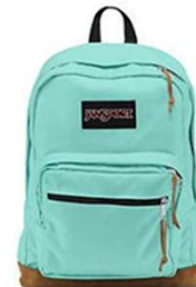
Bookbag (no wheels and no single strap)