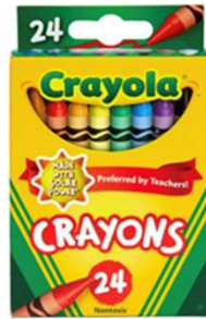
2 Packs of Crayola Crayons (24 color pack)