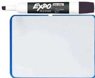
9in x 12in whiteboard with expo dry erase marker and eraser for student use