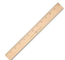
12 inch ruler (with inches and centimeters)