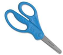
2 Kid Safe Scissors-Blunt Tip (1 to be used in school and 1 to be kept for use at home)