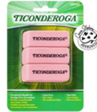
4 Large Erasers