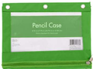
1 Large Pencil Pouch with zipper (No hard pencil boxes)