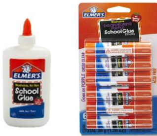
1 bottle of liquid glue and 1 Large glue stick