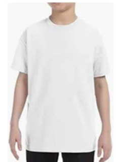
Plain white over sized T-shirt for STEAM projects