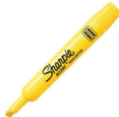
Highlighters (2 yellow highlighters)