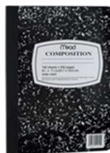
6 Composition Notebooks