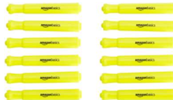
Highlighters (2 yellow highlighters)