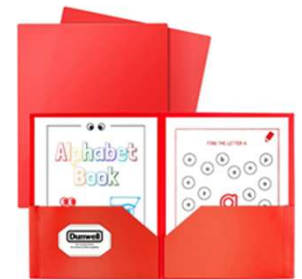
5 plastic/Poly Duotang Folders with Fasteners and Pockets (1 Red 1 Green 1 Blue 1 Purple 1 Yellow)