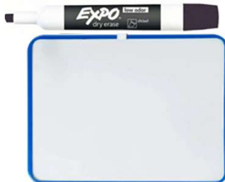
9in x12in whiteboard with expo dry erase marker and eraser for student use