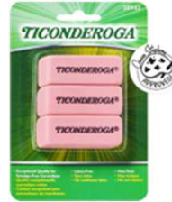
4 Large Erasers