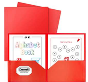
3 Plastic/Poly Duotang Folders with Fasteners and Pockets (1 Red, 1 Green, and 1 Blue)