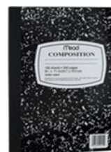
6 Composition Notebooks (Math, Science, Reading, Language Arts, Social Studies, & Intervention)