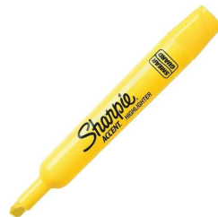
Highlighters (2 yellow highlighters)