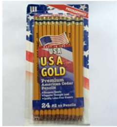
24 Standard Yellow #2 Pencils Pre-sharpened (No mechanical pencils or sharpeners allowed in school)