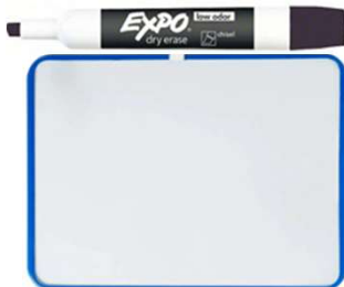
9in x 12in whiteboard with expo dry erase marker and eraser for student use