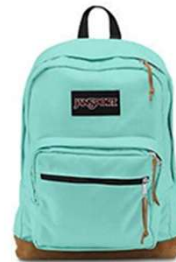
Bookbag (no wheels and no single strap)