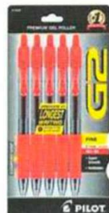
4 Red Pens for Writing Plan