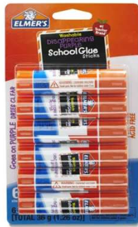
4 Large Glue Sticks