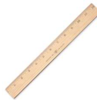
12 inch ruler (with inches and centimeters)