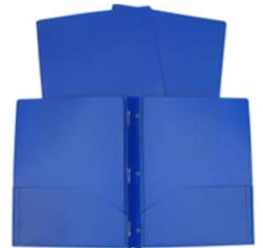
6 Plastic/Poly Duotang Folders with Fasteners and Pockets