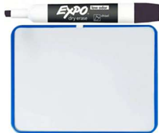
9in x 12in whiteboard with expo dry erase marker and eraser for student use