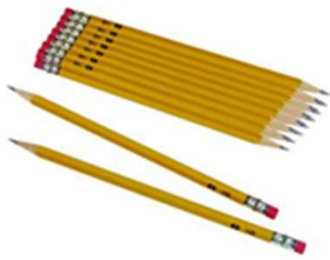
64 Standard Yellow #2 Pencils Pre-sharpened (No mechanical pencils or sharpeners allowed in school)