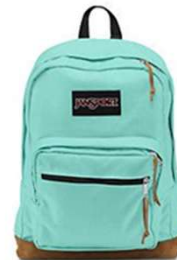
Bookbag (no wheels and no single strap)