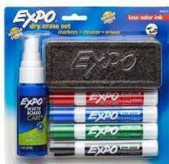
Expo Dry Erase Markers Chisel Tip (Pack of 4)