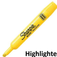
Highlighters (orange, yellow, light green) (No permanent markers/sharpeners allowed in school)