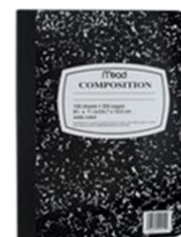
5 Composition Notebooks (Reading, Language Arts, Math, Science, and Intervention)