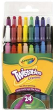
1 Pack of Crayola Crayons (24 color pack)