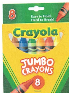
One pack of 8 Large Crayons (Crayola)