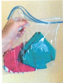
Extra Full Set of Clothes in a Ziplock Bag (labeled with student name, please include underwear and socks)