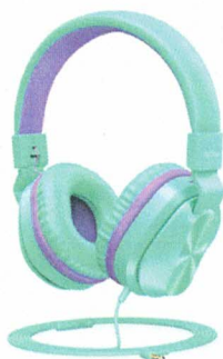
Kid Headphones (with a cable to connect into a computer in a ziplock bag with student name required)