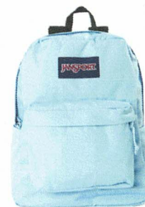
Bookbag (big enough to fit Home Learning folder; no wheels)