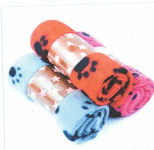
Small Blanket and Crib Sheet (to cover rest mat)