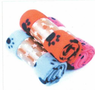
Small Blanket and Crib Sheet (to cover rest mat)