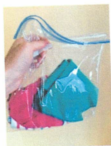
Extra Full Set of Clothes in a Ziplock Bag (labeled with student name, please include underwear and socks)