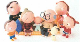
1-4x6 Family Picture