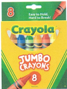
1 Pack of JUMBO Crayons (8 colors)