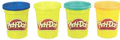
Play-Doh 4 Pack (any color)