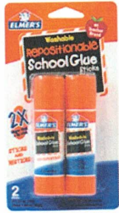
2 Jumbo Glue Sticks