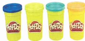
Play-Doh 4 Pack (any color)