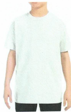
Plain white over sized T-shirt for STEAM projects