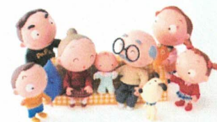
1 – (4in x 6in) Family Picture