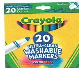
One pack of fat markers (Crayola)