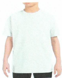
Plain white over sized T-shirt for STEAM projects