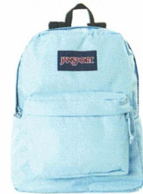
Bookbag (big enough to fit Home Learning folder; no wheels)