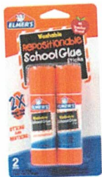
Jumbo Glue Sticks