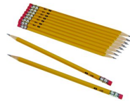
24 Standard Yellow #2 Pencils

(No mechanical pencils, 5 pre-sharpened pencils are required in class daily)