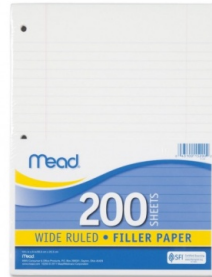
1 Pack of Wide Ruled Paper