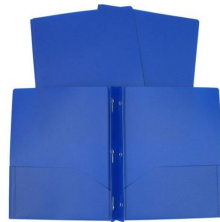
5 Plastic/Poly Folders with 3 Prongs and Pockets

(Red-Math, Blue-Reading, Yellow-Social Studies, Green- Science, Orange-Homelearning)