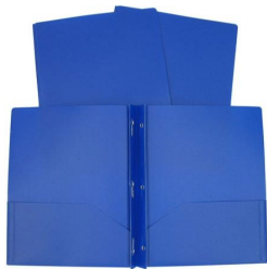
1 Plastic/Poly Folder with 3 Prongs and Pockets