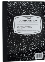
5 Composition Books

(Bring one pack to school at a time as needed)