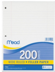
4 Packs of Wide Ruled Paper

(Bring one pack to school at a time as needed)