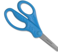
Children's Scissors (Blunt tip)

(No mechanical pencils, 5 pre-sharpened pencils are required in class daily)