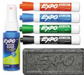
4 Pack of Dry-Erase Markers and Eraser