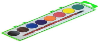
Watercolor Set (With brush)