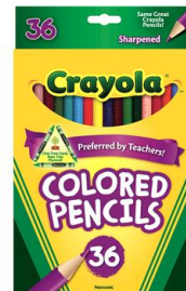
Colored Pencils (No Markers)

(Math, Science, Reading, Language Arts, Spanish)