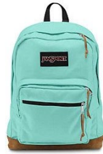
Bookbag (No wheels and no single strap)