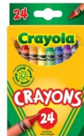
Crayons (24 colors)

(Red-Math, Blue-Reading, Yellow-Social Studies, Green- Science, Orange-Homelearning)