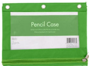
Pencil Pouch with Zipper (No hard pencil boxes)