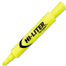
2 Highlighters (Any color)