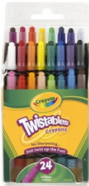
Crayons (24 colors)