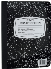
5 Wide-Ruled Composition Books *Required* (Not the primary ones)