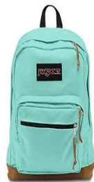
Bookbag (No wheels)