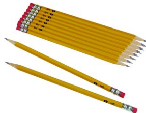
24 Standard Yellow #2 Pencils (No mechanical pencils, 5 pre-sharpened pencils are required in class daily)