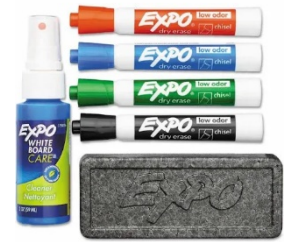
4 Pack of Dry-Erase Markers and Eraser

*Computers will be used all year for classwork and homework. Please make sure you have access to a computer and printer in order to complete homework assignments.*