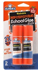
2 Glue Sticks