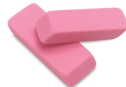
2 Boxes of Erasers