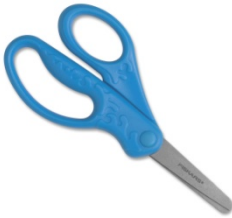
Children's Scissors (Blunt tip)