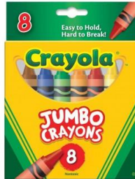
1 Pack of Jumbo Crayons (8 colors)