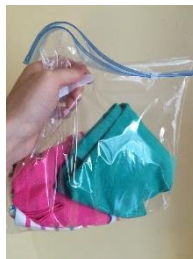
Extra Set of Clothes in a Ziploc Bag (Labeled with student's name)