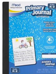
1 Primary Composition Book