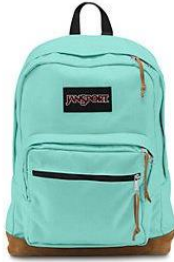
Bookbag (No wheels)