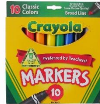
Crayola Fat Markers (Primary colors)