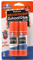
2 Fat Glue Sticks (Elmer's)